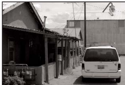
Below, the Helena Chemical plant in Mesquite. Left, a neighborhood resident's house is located only yards from the Helena plant (the metal building in background.)