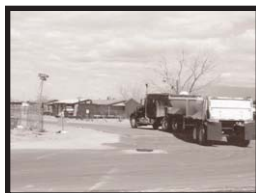
Top: Rod Ventura with visiting Buddhist master; the Roundhouse; trash truck in the South Valley.