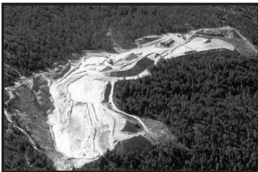
Right, Picuris protest of the mine in 2002; in the foreground is micaceous pottery Above, the mine in 1999

In February, 2004, the Law Center and our co-counsel filed an aboriginal title claim on behalf of Picuris Pueblo for land on which an industrial mica mine is sited. The land, sacred to the Picuris People because of its micaceous clay deposits, was sold by the US government during the 1950s under the auspices of the federal 1872 Mining